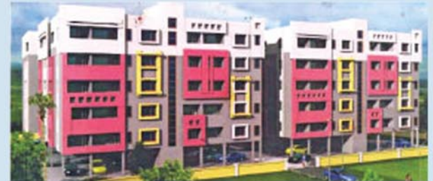
Panchawati Residency, Barbil, Odisha