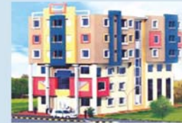
Joda Tower, Joda, Odisha