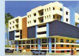
Panchawati Tower, Barbil, Odisha

GURUKUL GRANDEUR is one of the first projects of the Group in Kolkata. With a presence in the entire East, Gurukul is now extending its presence in Kolkata with a number of notable projects.