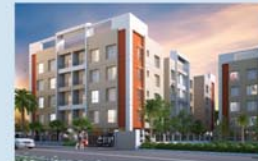
Gurukul Grande Phase I, New Town